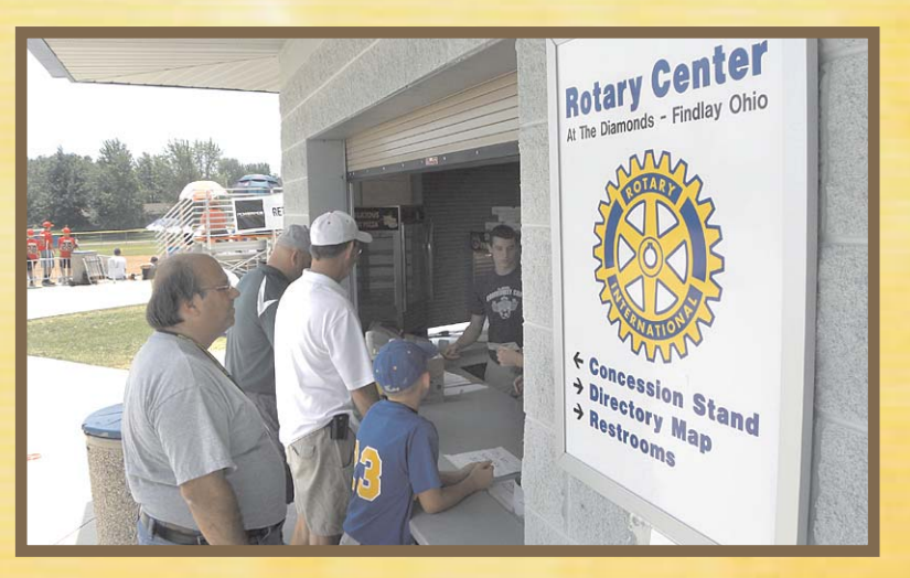
The Fort Findlay Playground at Emory Adams Park and "The Field of Dreams" located at The Cube are two local projects Rotary members financially supported and helped with construction.