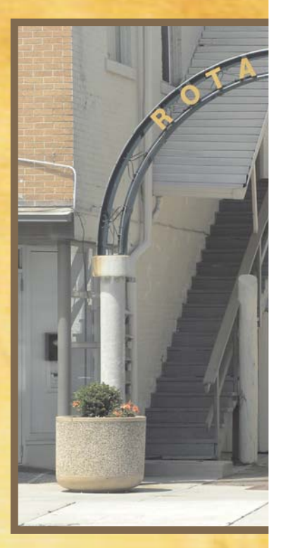
Rotary Way was a dow