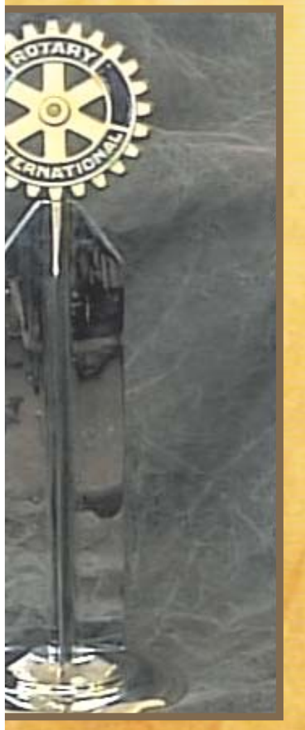
The "GO DEVIL"