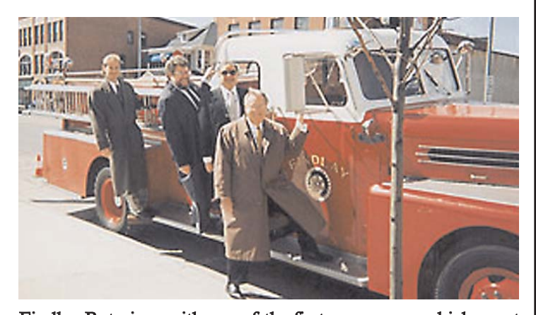
Findlay Rotarians with one of the first emergency vehicles sent to Quetzaltenango, Guatemala - and still in use today.

to the healing needs of Guatemala, Zambia or Cambodia. Rotarians have resources to collect, sort, identify, store and ship millions of dollars of still usable medical supplies and equipment.