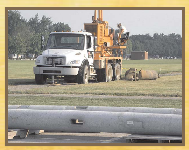
Under construction at Emory Adams Park are two premier soccer fields that will become Rotary Arena. The ribbon cutting and first games will be September 24th.