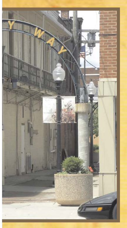
wntown improvement project.