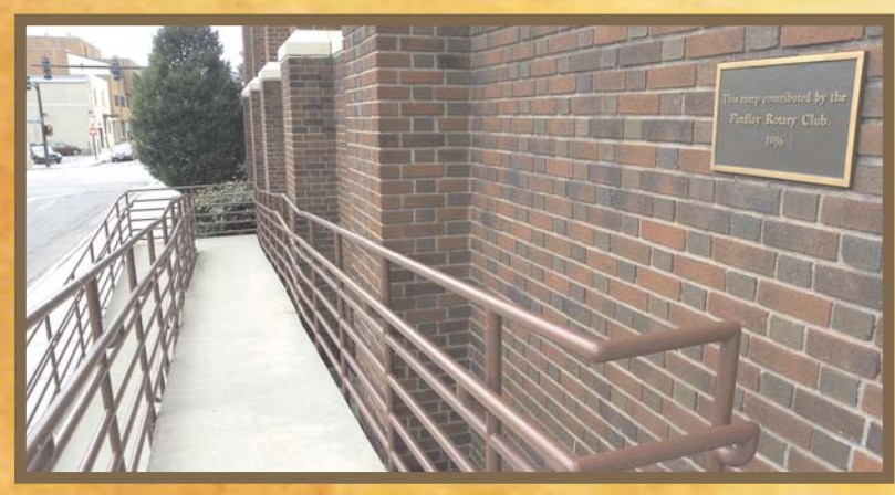
The ramp at Central Auditorium was donated by Rotary.