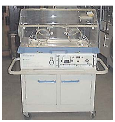
Infant incubator donated by Mansfield Hospital and sent to medical mission in Mexico.

In the United States, there's a huge wealth of usable medical equipment and supplies that are no longer in use. Some may be in your local hospital, a storage room or even your own garage.